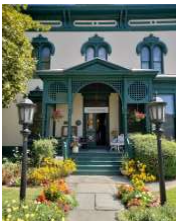
The John Wells Pratt House Museum