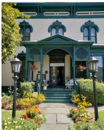
The John Wells Pratt House Museum