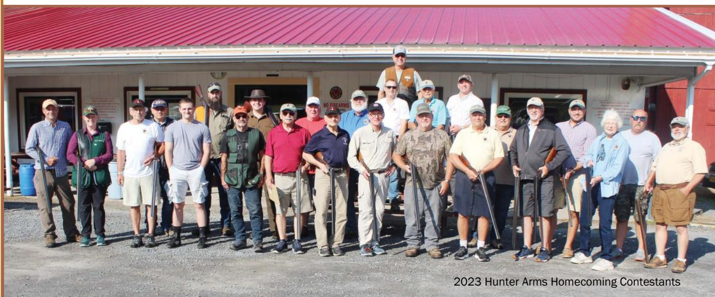
2023 Hunter Arms Homecoming Contestants

The Friends of History hosted the 12th annual Hunter Arms Homecoming Weekend this past summer on August 11 and 12. The Hunter family along with Hunter Arms/L.C. Smith collectors and enthusiasts from across the country gathered together in Fulton to relish in the camaraderie and revel in friendly competition.