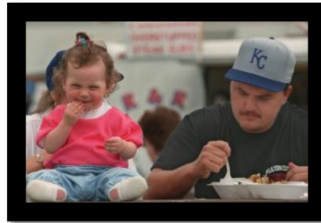
This one-year-old smiles while she and her parents eat at the Elks Club chicken BBQ at the festival in 1996.