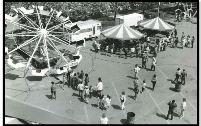
Overall shot of the Chocolate Festival, 1987.