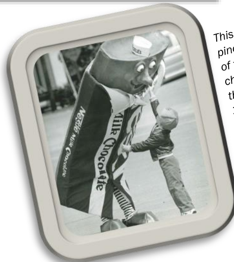
This little boy pinches the nose of the Nestle chocolate bar at the festival in 1987, Photo by Nicholas Lisi.