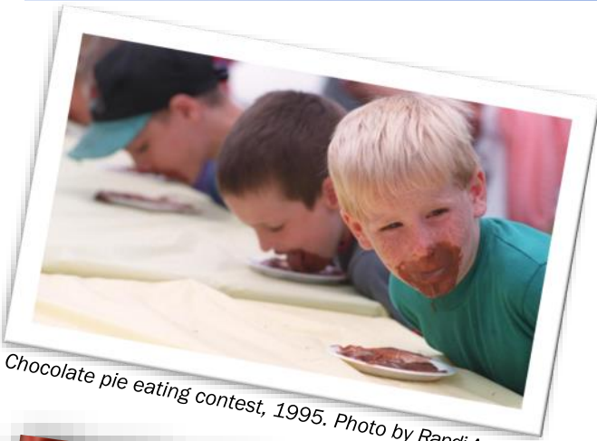
Chocolate pie eating contest, 1995.