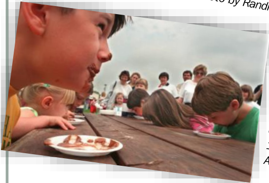
This boy looks up to see that he has beaten the other kids in the pudding eating contest, 1996.