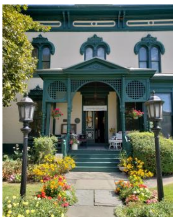
The John Wells Pratt House Museum